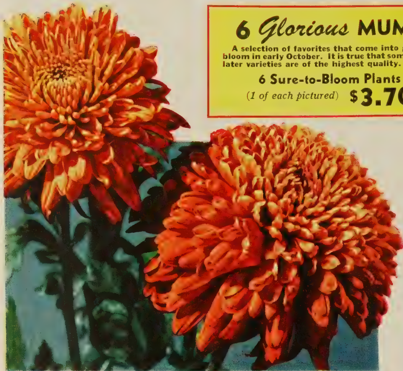
CARNIVAL. 75c each; 3 for $2.00